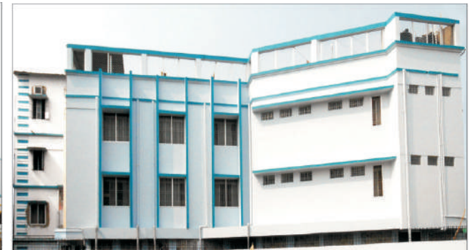
Separate Hostel for Girls