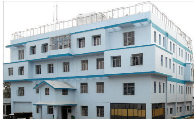
Separate Hostel for Boys