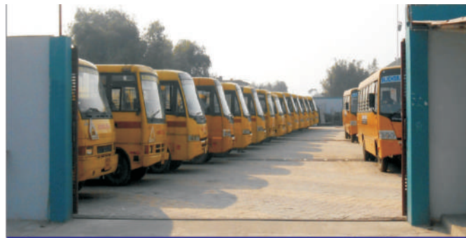
Separate gate for entry and exit of buses